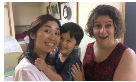
RETURNEES IN OSAKA MAKING CONNECTIONS